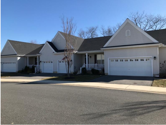
This Picture shows the front elevation of the building