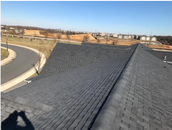
This picture shows an overview of the middle of the building and ridge vent system. The ridge vent appears to be in good condition