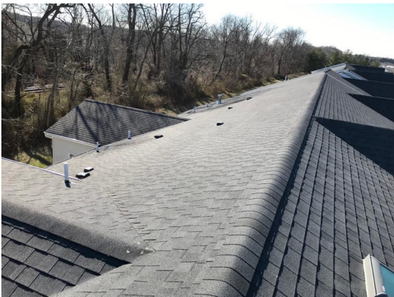
This picture shows on over view of the back elevation